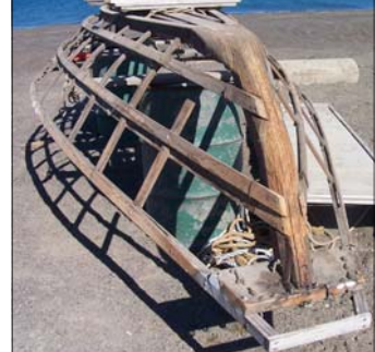
The Eskimo canoes are stored with the skin off.