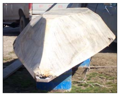
Skin on, ready to launch