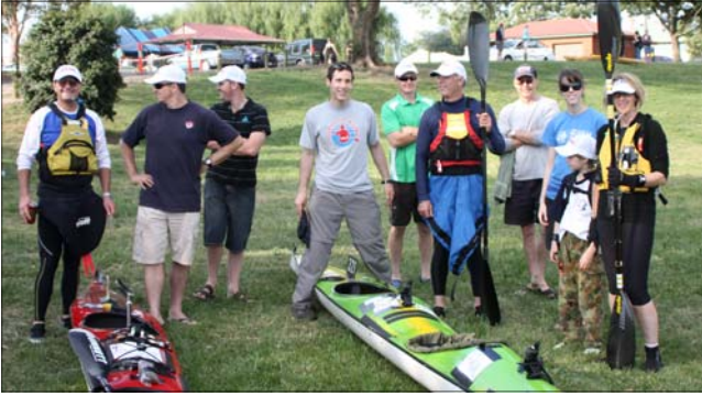
Lane Cove competitors and supporters at Windsor