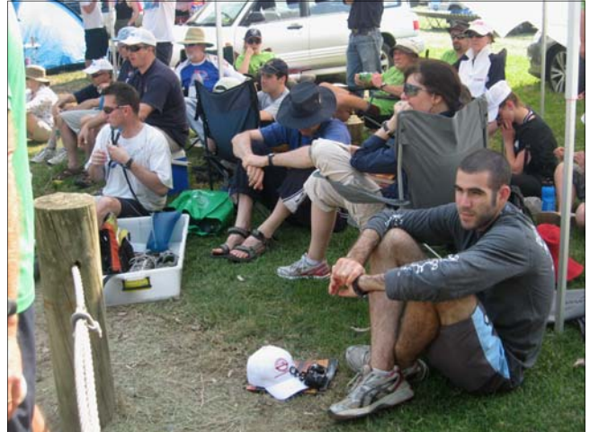
The LCRK marquee was a popular gathering point