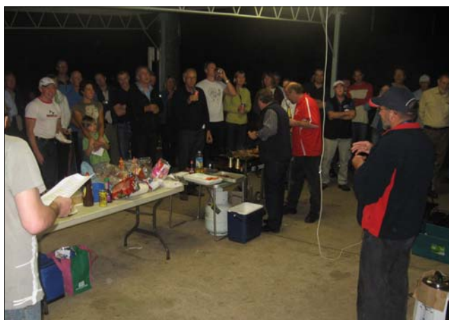
Storytelling was a blast at the post-Classic BBQ

Check our website, www.lcrk.org.au , for lots of pictures of the Classic. If you see some you'd like to keep, you can easily download them to your own computer.