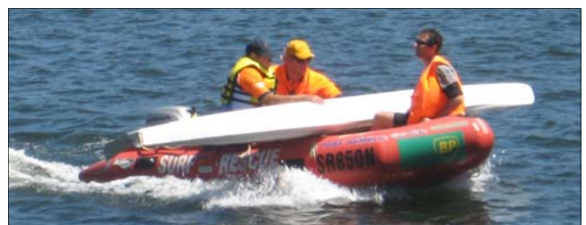
Some marathon competitors got a lift home