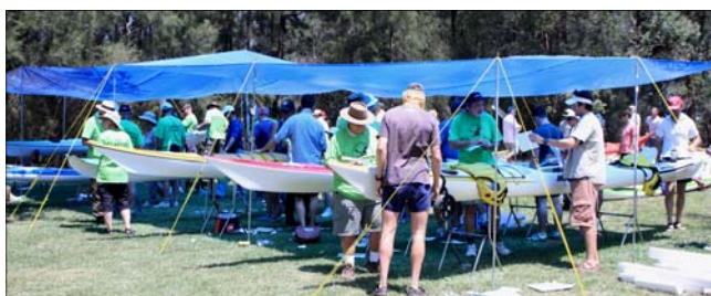
The long day starts with scrutineering