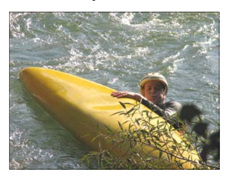
... and the other way

ter pinning him in the cockpit. However he managed to kick himself free and said the incident taught him to treat the river with respect.