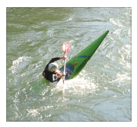
The correct way ..

Urs was washed under a rock and for about 20 anxious seconds was trapped underwater by the rush of wa-