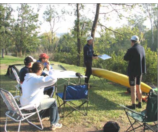
Outdoor classroom at the camp site