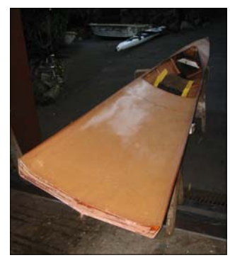
Above left: Last year's Classic and Murray winner, with a bulb bow, the front of which was fully submerged. Right: Experimental planing short rec.

We then converted it to a TK1 by adding a rudder and a little length. We