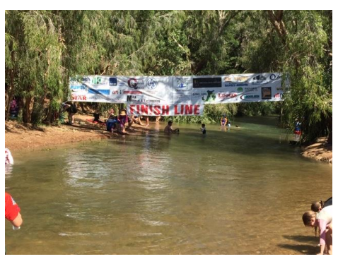
The Finish "The Bridge"