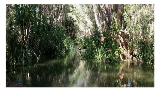
Ohh "The Pandanus"