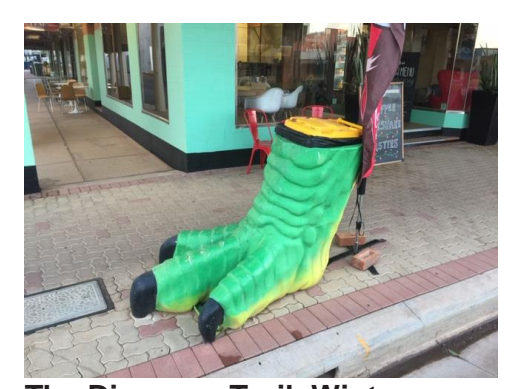
The Dinosaur Trail, Winton. QLD