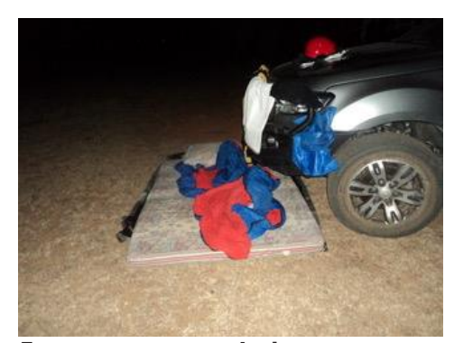
5 star accommodation