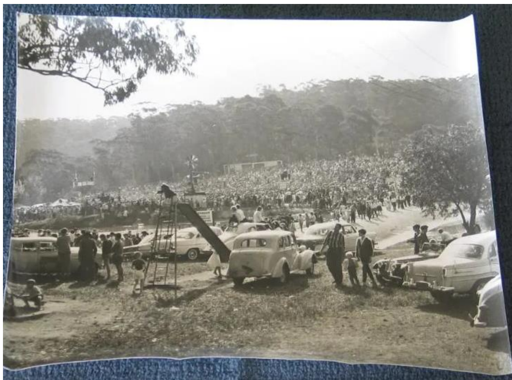
Above: A couple of snaps from the 1963 2UW Rock N Roll Spectacular.