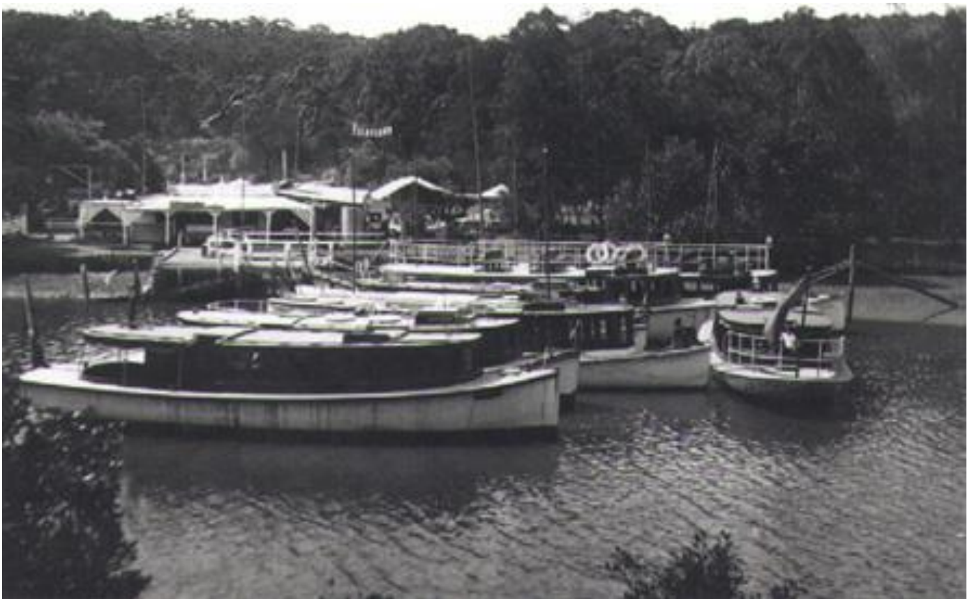
Above: Picnic boats drawn up at "Fairyland" wharf, around 1930