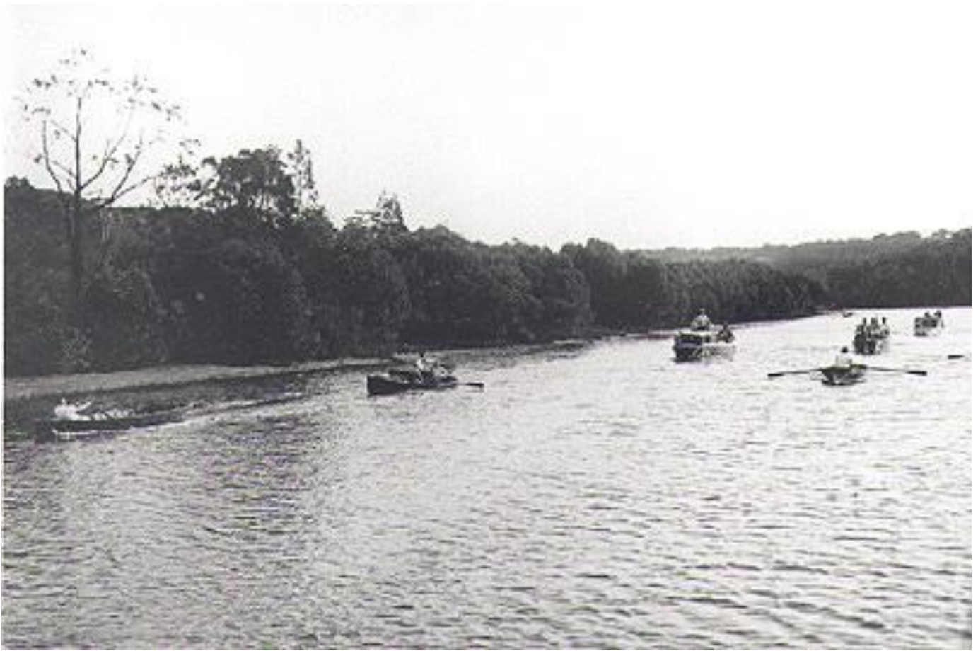
Above: Predecessor to the Time Trial? A rowing race amongst picnic goers coming upriver opposite Fairyland (LCRK pontoon would be approx. mid-photo on opposite bank).