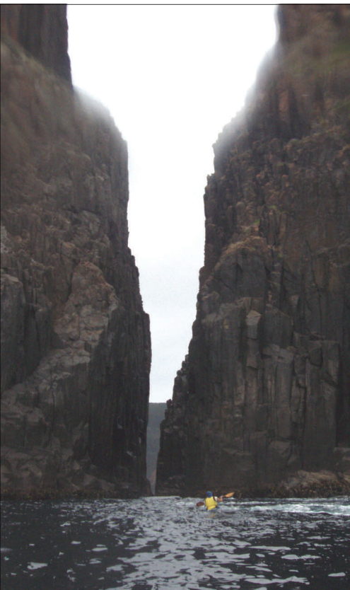
Fluted Cliffs, South Cape

Day 28 Exactly two weeks after our last shopping opportunity in Strahan, we landed in Southport. The time was 12.30pm, but the shop closed at midday. We stared in the windows at