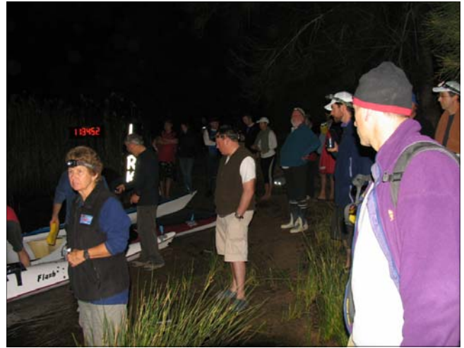
Landcrew search the dark river for their competitors

cluding one promoting Nurofen as the new performance-enhancing drug.