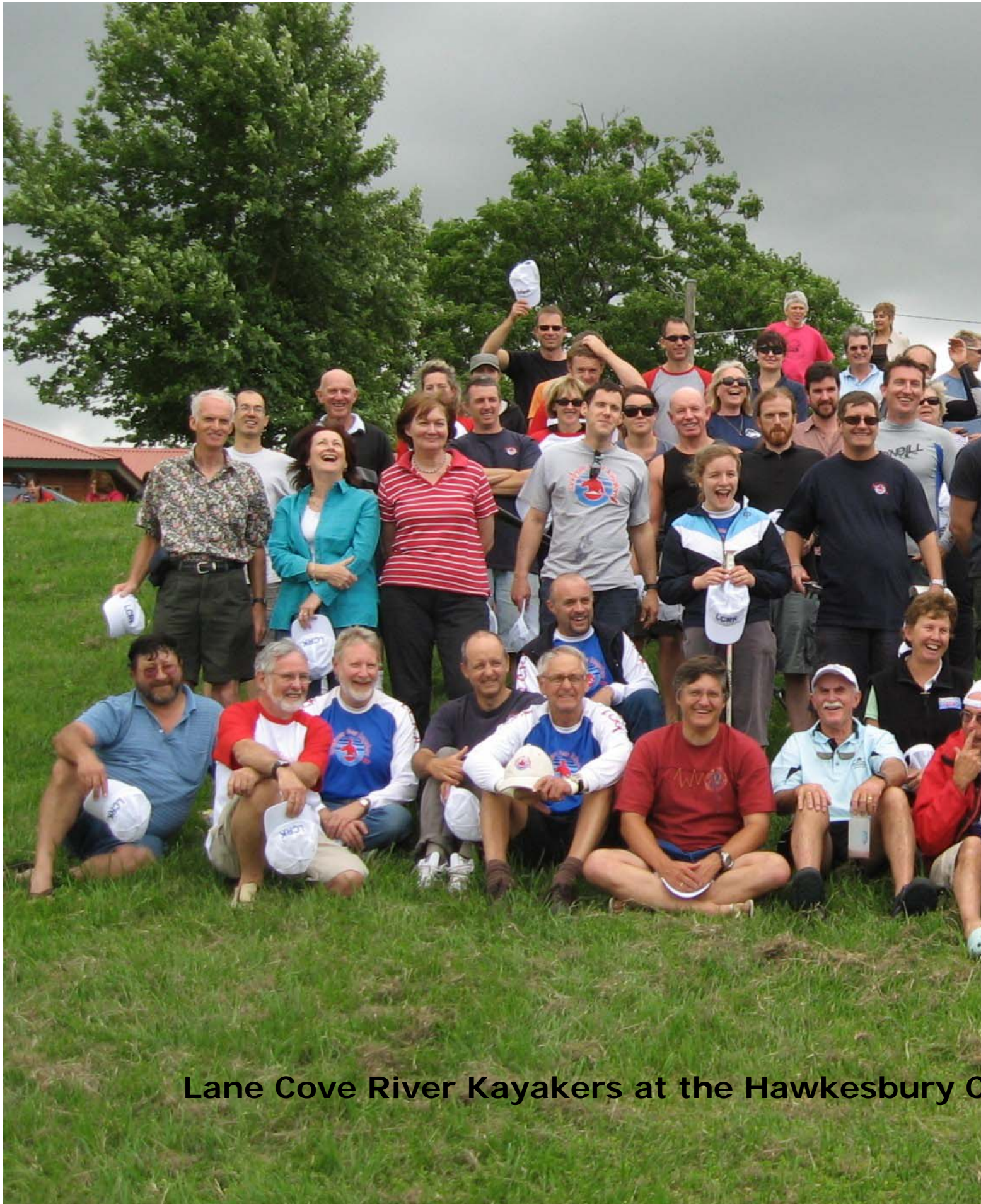
Lane Cove River Kayakers at the Hawkesbury C