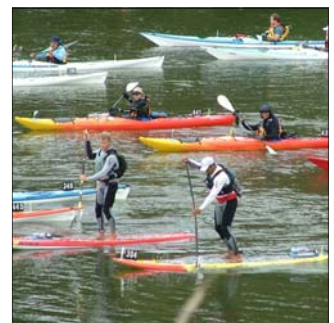
These two paddled all the way to Brooklyn — in 17+ hours