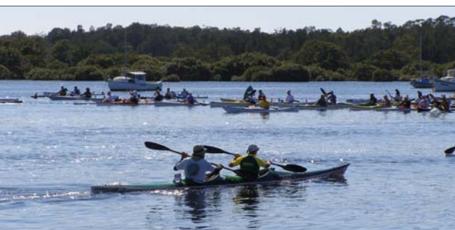
Left: The mixed K4 crew. Below: Off to the start.