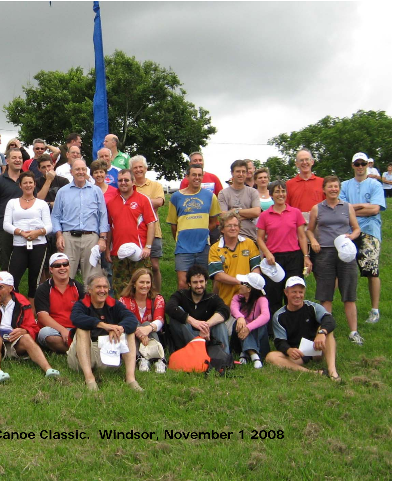
Canoe Classic. Windsor, November 1 2008