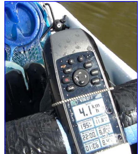
Anjie paddles through 12 hours of non-stop torrential rain. Right: 9.06am and the onboard data shows the old record is broken.

the best I could to add as many kilometres as I could to finish on 201km (shown on the display setting on the Garmin 78S).