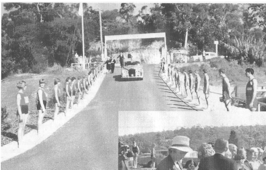
Opening of Athletic Field by his Excellency Sir Roden Cutler 15 April 1967

The achievement was not without its difficulties, the most poignant of which was finance. The most significant lump sum financial contribution was that of £10,000 from Willoughby Municipal Council after lengthy debate and discussion. Records show that the total cost of the Athletic Field including cash and kind was of the order of £90,000