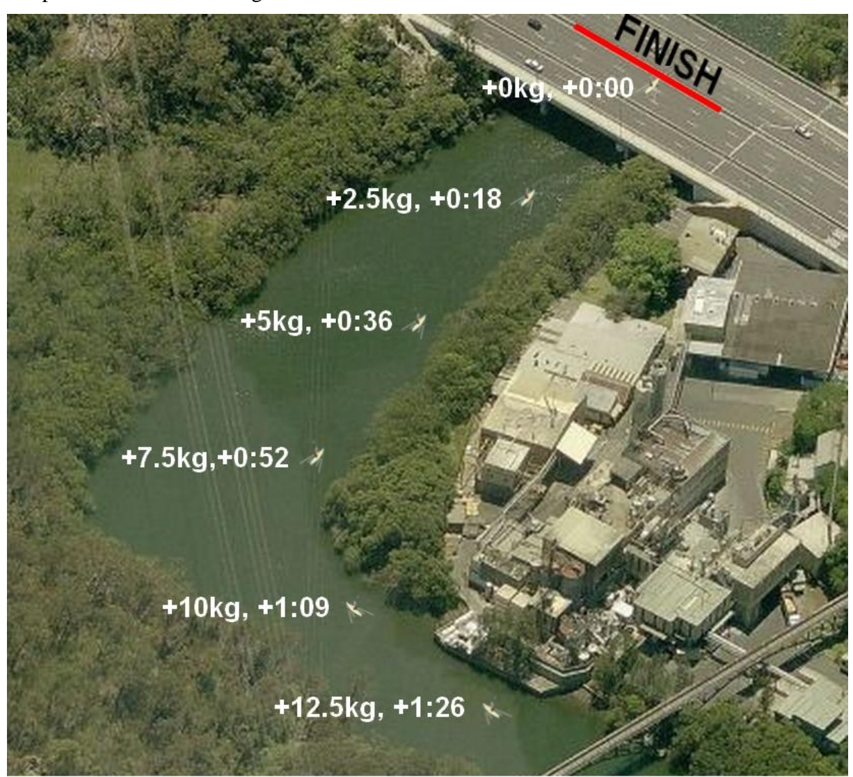
Figure 2: Effect of extra dead weight on average paddler's 12km finishing time (65 minute 90kg paddler)

They'll be about 7 seconds slower over 12km. Not a huge amount per se!, however the effect is cumulative. Figure 2 shows the effect of 2.5kg, 5kg, 7.5kg, 10kg, and 12.5kg extra dead weight on our paddler's 12km finishing time.